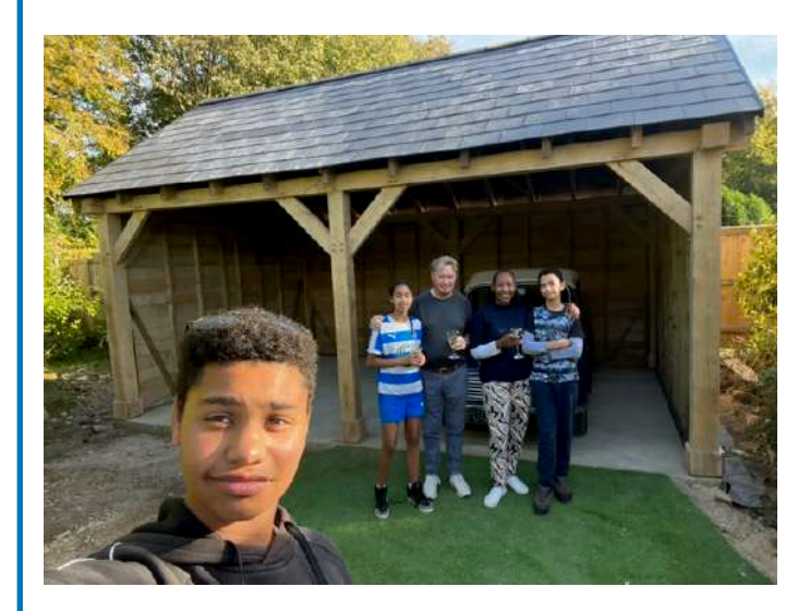
A new oak garage for Florence!