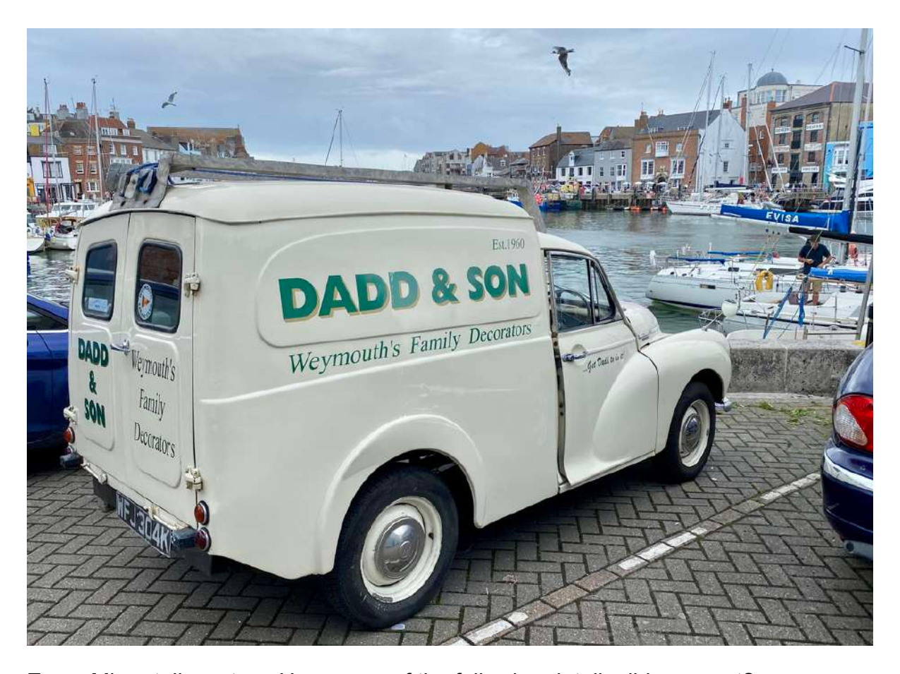
Every Minor tells a story. How many of the following details did you spot?