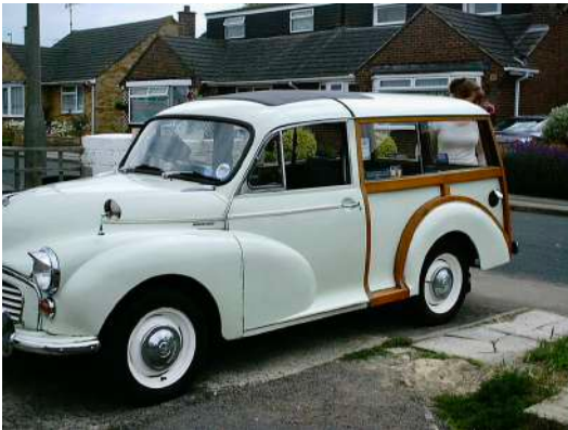
"George" had a sunroof

It would be nice to put the shield back into use after 24 years ... would anyone volunteer to organise a Treasure Hunt?