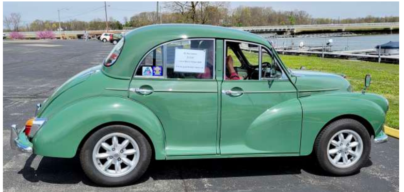
"Jessie" in the USA, April 2021