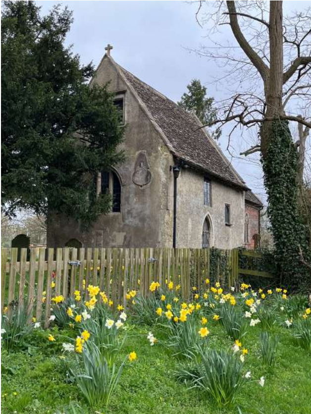
The Saxon church at Alton Barnes.